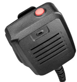
Remote Speaker Microphone QNM98-RT1