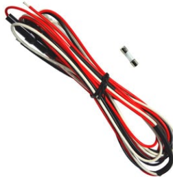
ACC Power Cable QNM98-ACCPC