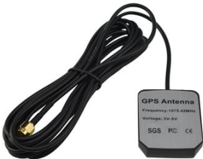
GPS Antenna QNM98-GPS