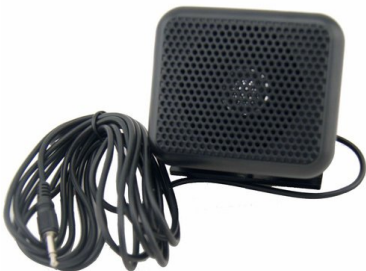
External Speaker-Square (2W 40hm) CCESP1