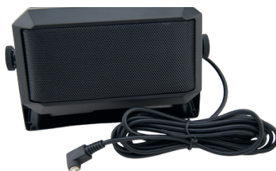
External Speaker-Rectangular (5W 80hm) CCESP3