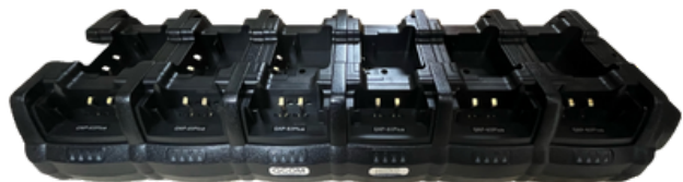
6/12/18 Bay Charger MPC6R/12R/18R-93