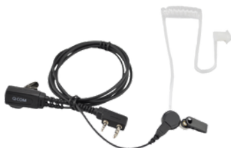
Covert Surveillance Earpiece CX2425-K2