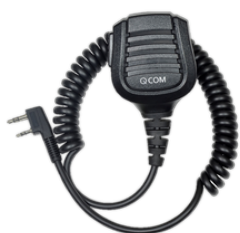
Remote Speaker Microphone TY02