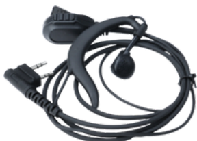
Earhook Earpiece TY100H-K1