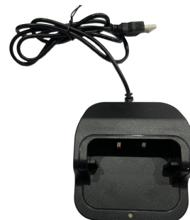
Single Pocket Charger SPC1-93