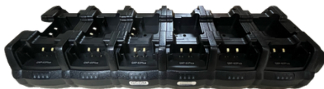
6/12/18 Bay Charger MPC6R/12R/18R-93