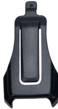
Belt Clip PD-2RD-BC