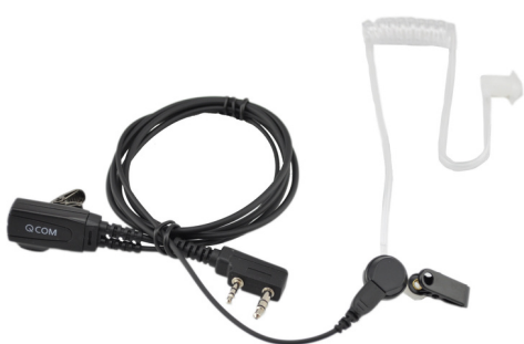
Covert Style Ear Piece CX2425K2