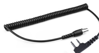
Commercial Headset Lead to Suit PD-2RD RT-I2 (to be used with RTRN-100A headset)