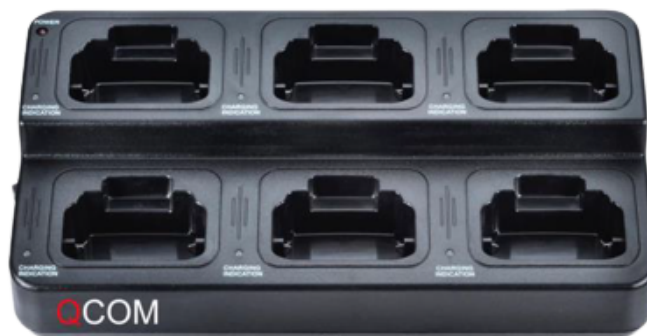
6-Bay Multi Charger PD-2RD-CH6