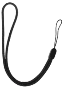
Hand Strap PD-2RD-HS