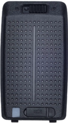
Battery Pack PD-2RD-BA