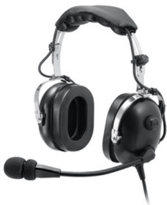
Commercial Noise Cancelling Headset RTRN-100A (to be used with RT-I2 lead)