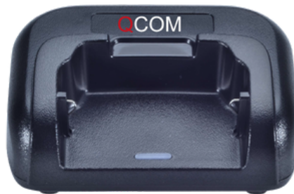
Single Pocket Charger, USB Type-C Cable and Power Supply PD-2RD-CH