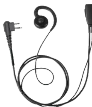
Over-the-ear Style Ear Piece CX502K2