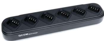
Six Bay Charger MPC6R-80