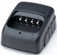
Single Pocket Charger SPC1-80