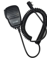
Remote Speaker Microphone TY-01