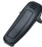
Belt Clip BC-80