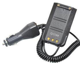
Battery Eliminator (Included in Tradies Case). BE-80