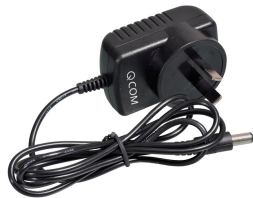
Power Adaptor XIA-P127A-B6533