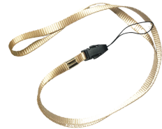
Long Lanyard LYN1